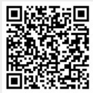
RIPE NCC Academy